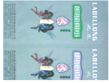
Figure 2: Digital TubeScan strobe+ with digital strobe function and missing label control.

Cover the entire width and image display on a sufficiently large screen (> 22" monitor with